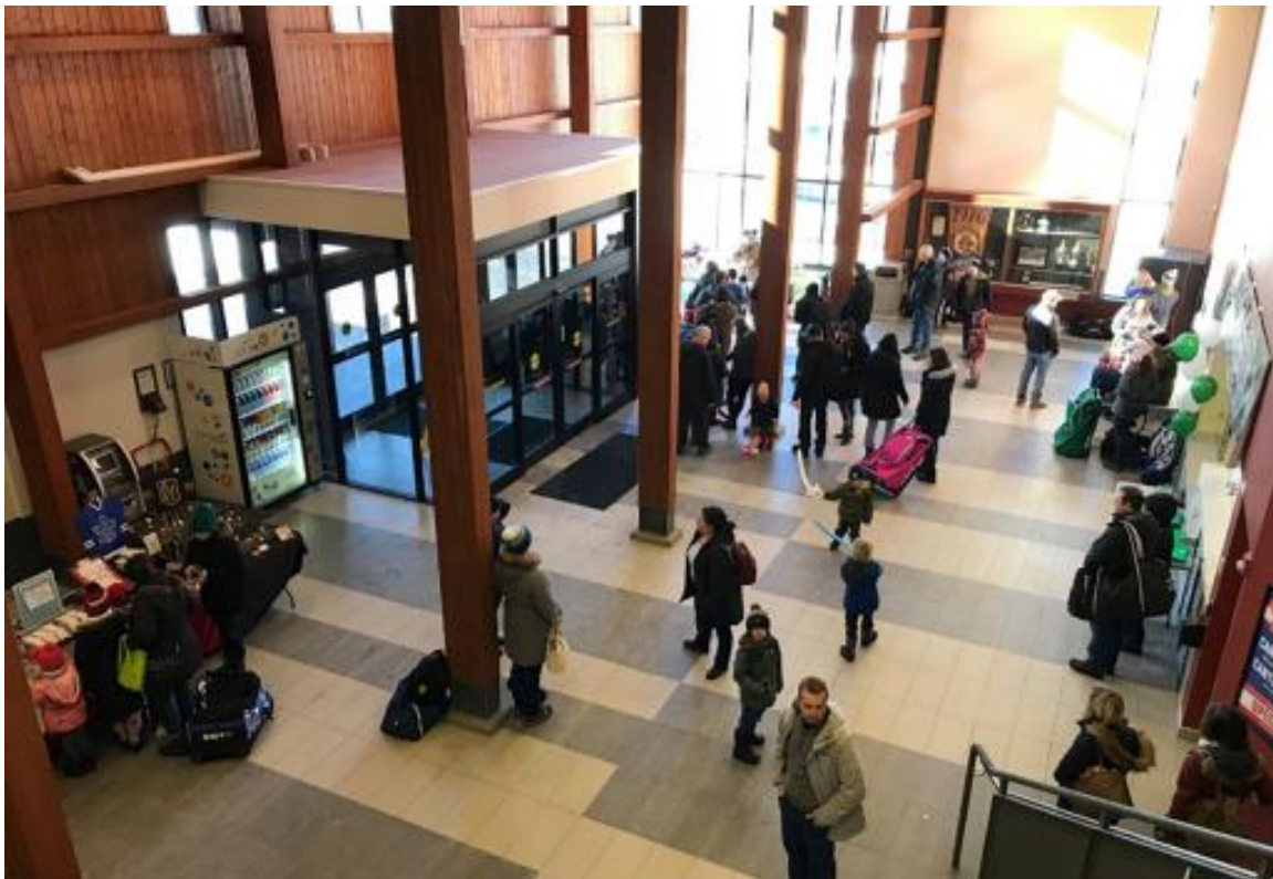
CIH Arena – Interior lobby