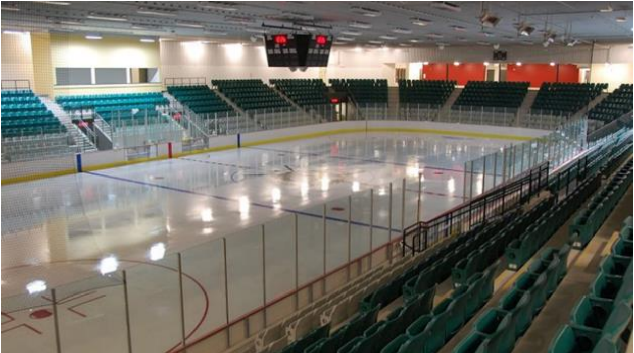
CIH Arena – Interior ice surface