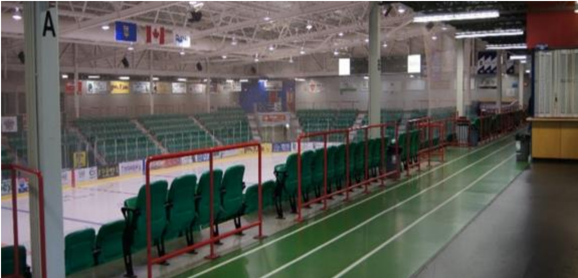
Okotoks Pason Arena - Interior with community walking track