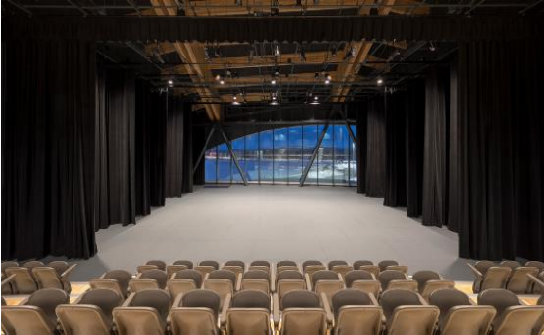
BMO Theatre Shane Homes YMCA – Interior Black Box Theatre