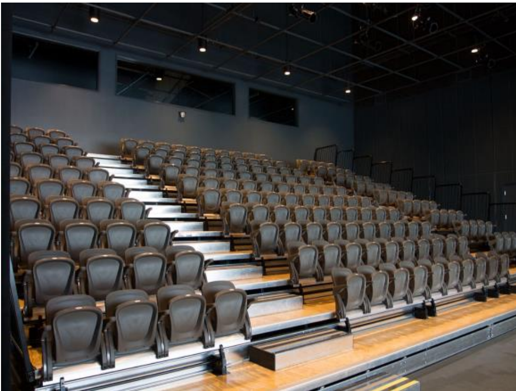
BMO Theatre Shane Homes YMCA – Interior Black Box Theatre