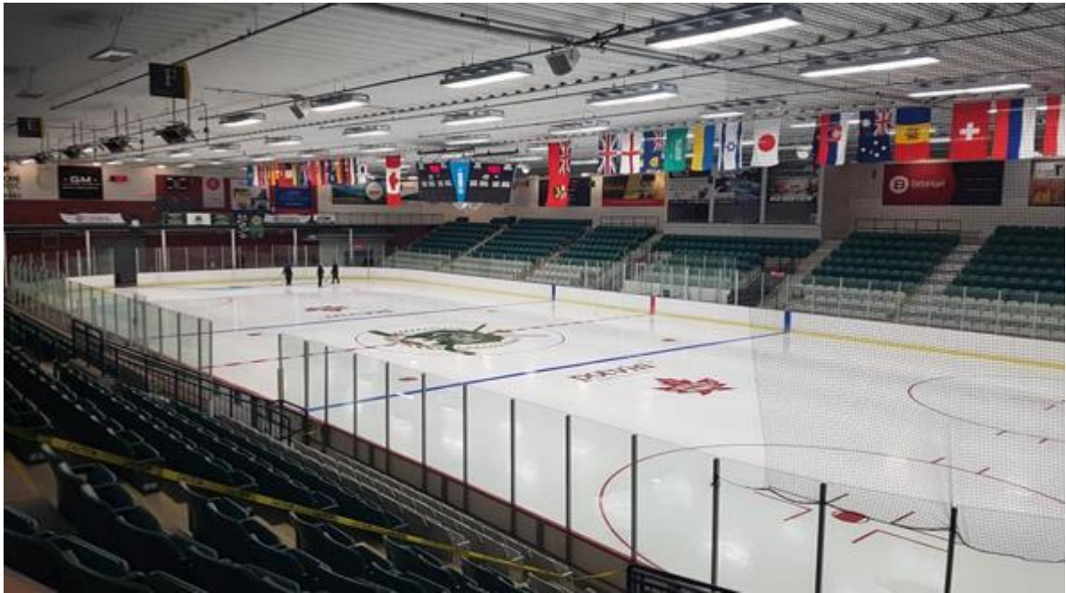
CIH Arena – Interior ice surface