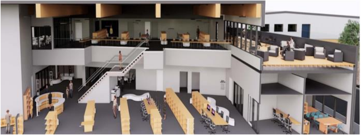
Blackfalds Multit-plex – Artist rendering library space