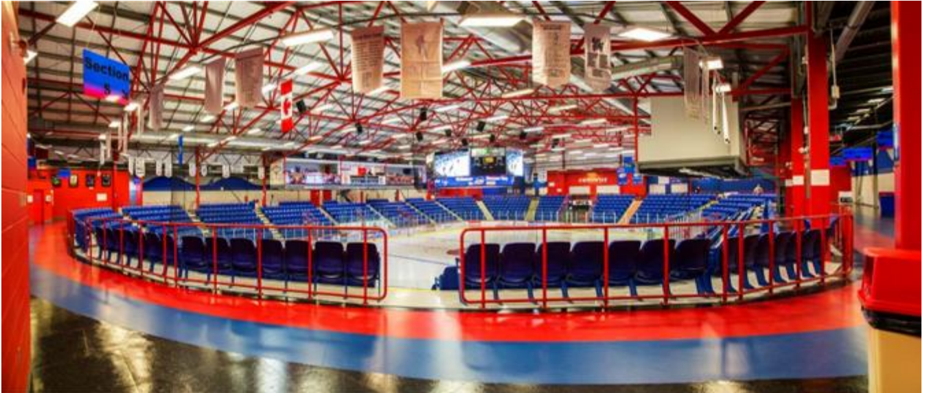
Interior with community walking track