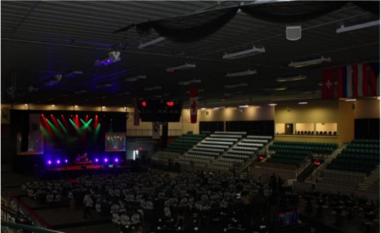
CIH Arena – Interior banquet event