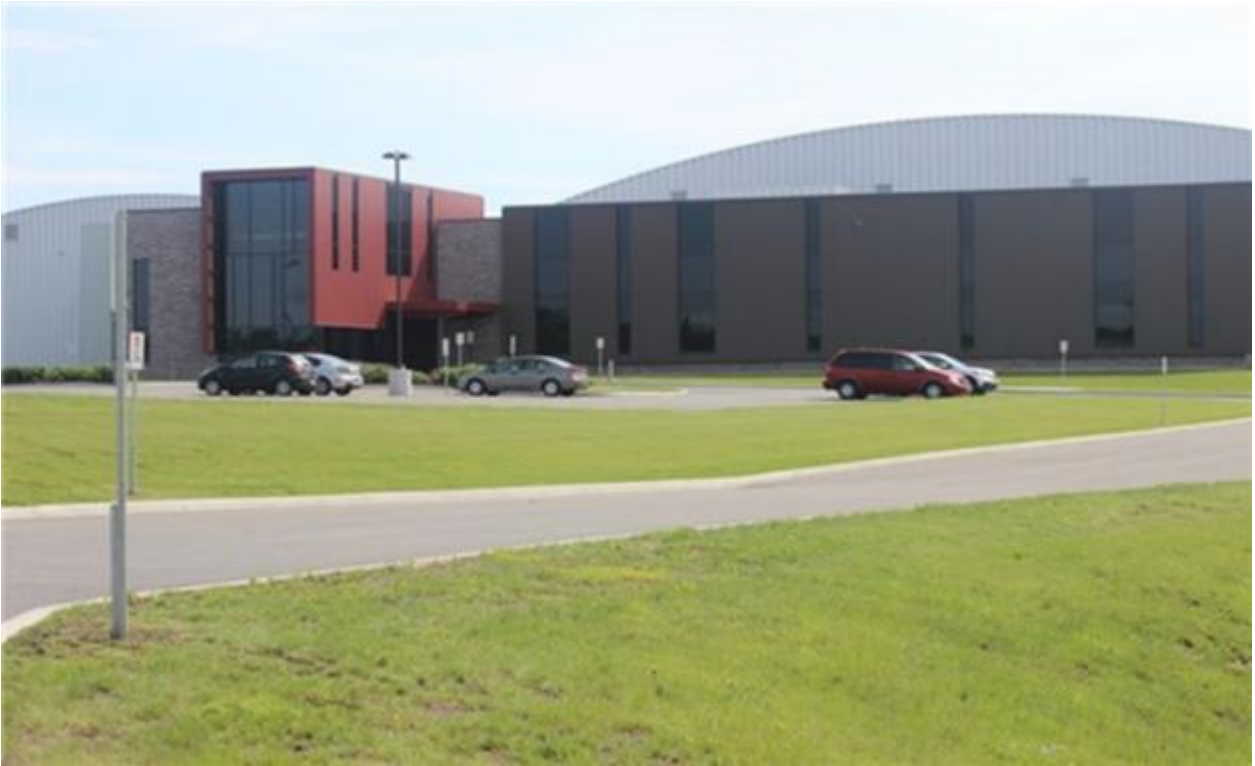
CIH Arena – further back view of the entire exterior of the facility.