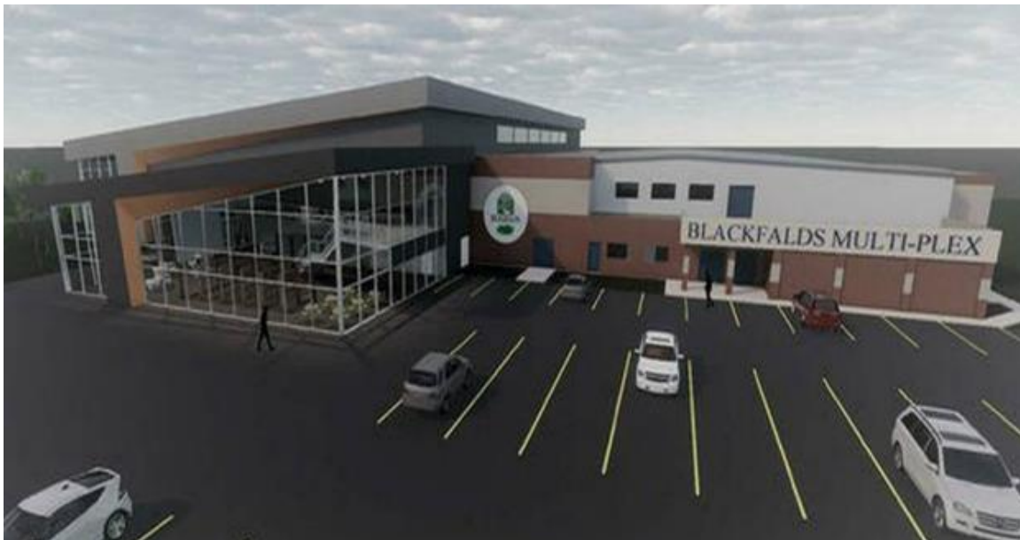
Blackfalds Multi-plex – Exterior artist rendering